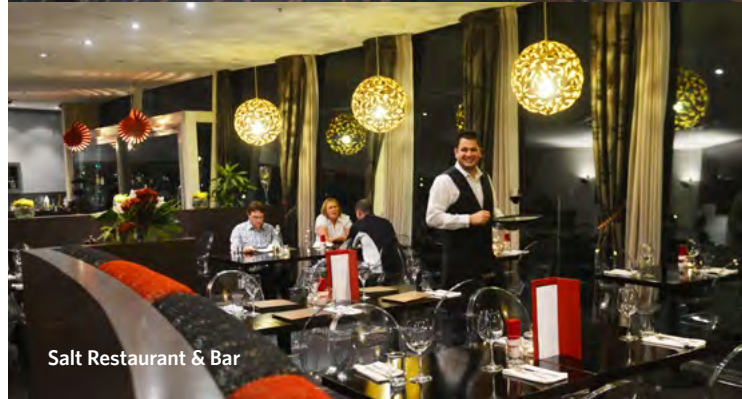
Salt Restaurant & Bar