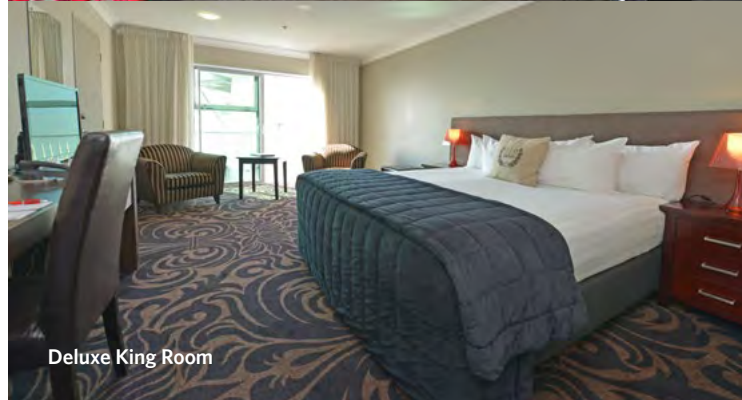
Deluxe King Room